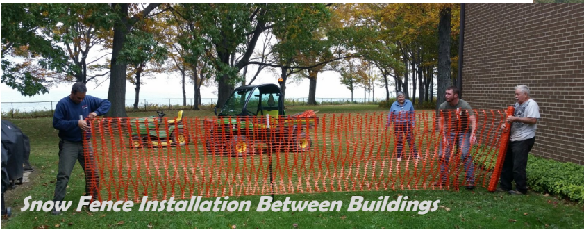
Snow Fence Installation Between Buildings