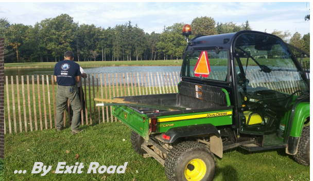
... By Exit Road