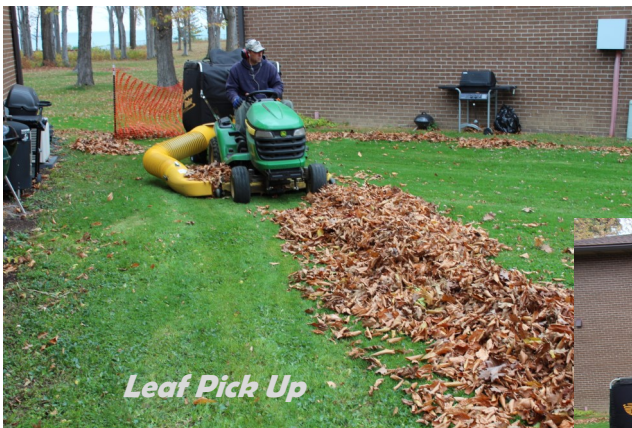
Leaf Pick Up