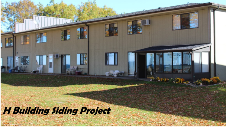
H Building Siding Project